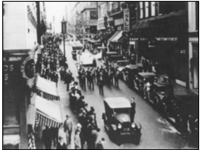
An eager crowd gathers on the streets to welcome Mei Lan-Fang as he rides through San Francisco's Chinatown on April 20, 1930.