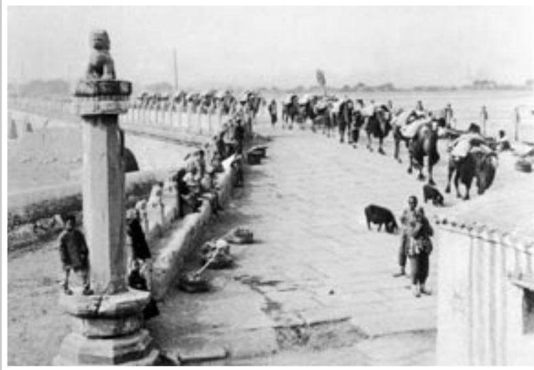
The Marco Polo Bridge 盧溝橋 located in the outskirts of Beijing during the 1920s. On July 7, 1937 the Second Sino-Japanese War began on this bridge, making it a historical site.