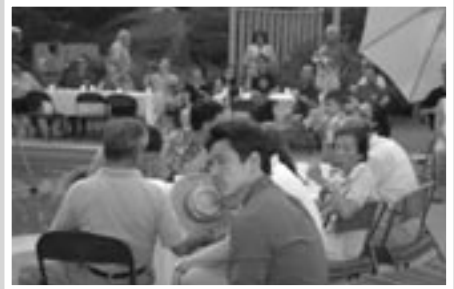
Guests enjoying the entertainment at the poolside party.