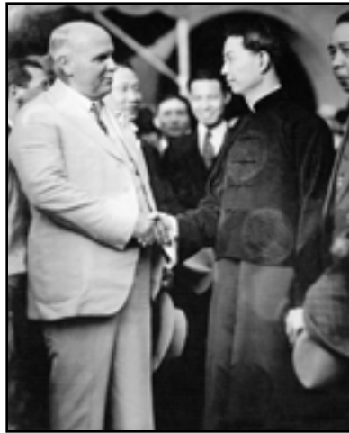
Mei Lan-Fang is greeted by San Francisco Mayor James Rolph on April 20, 1930.

On February 17, 1930 Mei Lan-fang and his troupe formally debuted their first two plays on U.S. soil entitled The Suspicious Sleeper 汾河灣, and Killing the Tiger General 費貞娥刺虎. In the first play, Mei Lan-fang played the leading lady Liu Yingqun 柳迎春, and in the second play, he again acted in the principle female role as Fei Zhenou 費貞娥. Due to the fact that most audience members knew little or nothing about Chinese opera, subtitles and explanations of the plot were provided during the performances. Despite the language and cultural