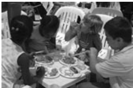
Students from the Confucius Institute Chinese Summer Program enjoy lunch in the museum garden.