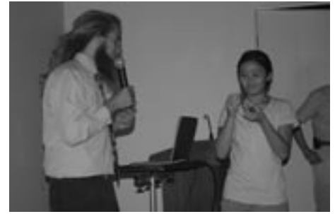
A young volunteer accepts the challenge and tries to open a "secret keyhole lock."