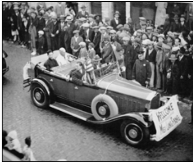
Mei Lan-Fang rides through San Francisco's Chinatown with Mayor James Rolph on April 20, 1930.

barriers, audiences were extremely impressed by the acting, the intricate gestures, the dazzling costumes, and the beautiful stage design. The troupe was very warmly received by the audience, and continuous applause prompted lead actor Mei Lan-fang to come out several times to take a bow. On the first night alone, Mei Lan-fang returned to the stage an incredible fifteen times! The audience was stunned not only by Mei Lan-fang's skill as an opera performer.