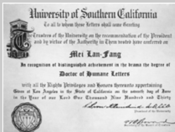
Diploma presented to Mei Lan-fang, “Doctor of Humane Letters,” from University of Southern California on June 7, 1930.

list of adoring fans grew rapidly. Everywhere he went Mei Lan-fang was received by hundreds of eager fans. From New York, Mei Lan-fang and his troupe traveled to Washington D.C., Chicago, and then San Francisco where he was greeted by Mayor James Rolph (San Francisco mayor 1912-1931) on April 20, 1930. From there, the troupe traveled to Hollywood where Mei Lan-fang was greeted by Mary Pickford and other movie stars. Near the end of the U.S. tour, the University of Southern California and Pomona College each presented Mei Lan-fang with honorary doctorate degrees of Humane Letters. At each stop on their tour Mei Lan-fang was welcomed by universities and museums, and these institutions sponsored the troupe and held banquets and receptions in their honor. The chancellors and presidents of the universities along with the executive directors of the museums always gave Mei Lan-fang the highest comments and regards.