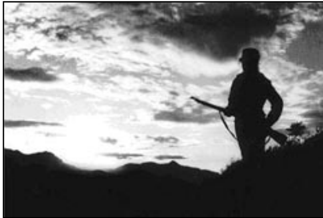
Figure 4: "Eighth Route Army Sentry at Mt. Heng," a photograph by Sha Fei

However, the symbolism was not reality. Ironically, it was Sha Fei's zealous dedication to documenting the Communist cause that led to his downfall. Exhausted by excessive overwork compounded by lingering tuberculosis, Sha Fei took his last photograph in 1946, as the Eighth Route Army was once again called to arms. This time, the enemy was no longer the Japanese, but their former comrades, the Nationalists 國民黨. Civil War had broken out in China. In 1948, Sha Fei's health collapsed completely, and he was admitted to