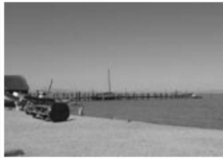
View of the beach and pier at China Camp