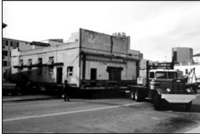
The mission building being moved to its current location on Third Avenue in 1993.

One last memory took place on the day of the delivery of the statue of the first emperor, Qin Shi Huang 秦始皇, which now adorns the front entrance to the extension building. The statue was encased in a large wooden crate with a steel frame for protection, measuring 9.5' x 6' x 4'. On the day of the delivery I happened to be alone in the museum, but it was clear that we would need several people and a machine to