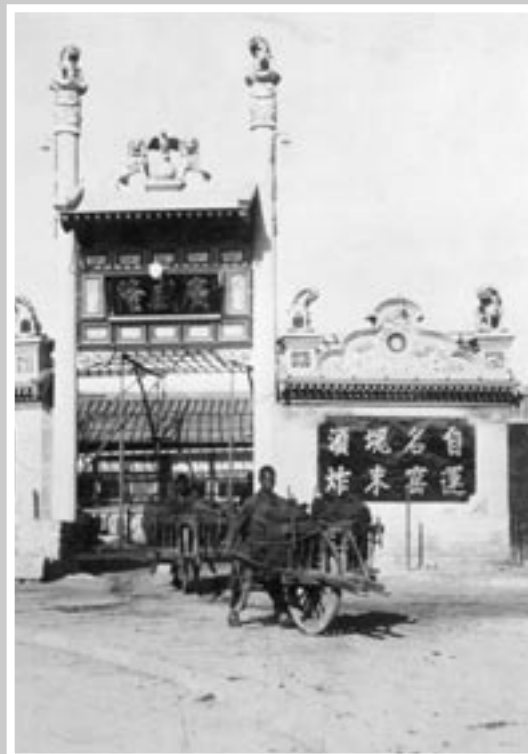
The wheelbarrow used to deliver coal in the Beijing area during the 1920s.