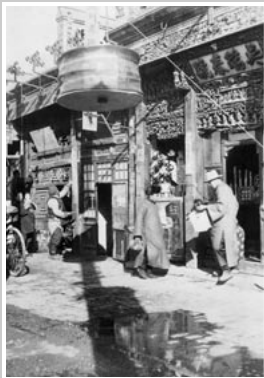
A fireworks and firecracker store in old Beijing 北京 during the 1920s.